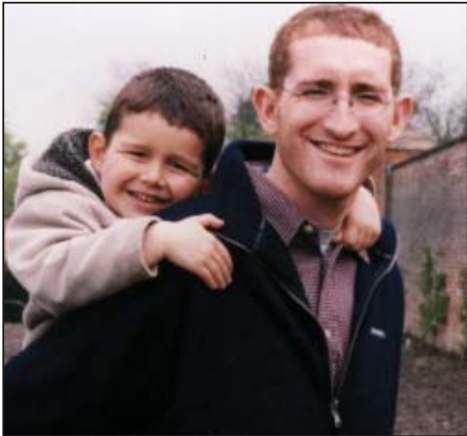
ABOVE: 'That's my boy!'