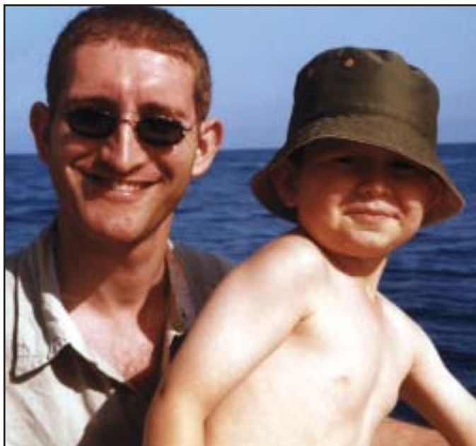
ABOVE: 'The lads on holiday!'