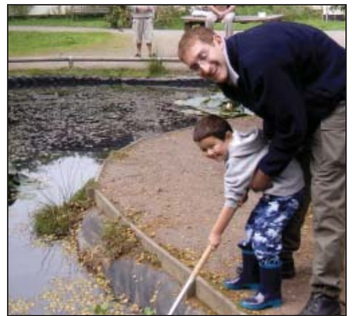
ABOVE: Messing about on the water - but don't let go dad!