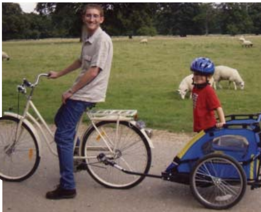
ABOVE: 'Ditch the Discovery dad, pedal power's much more fun!'